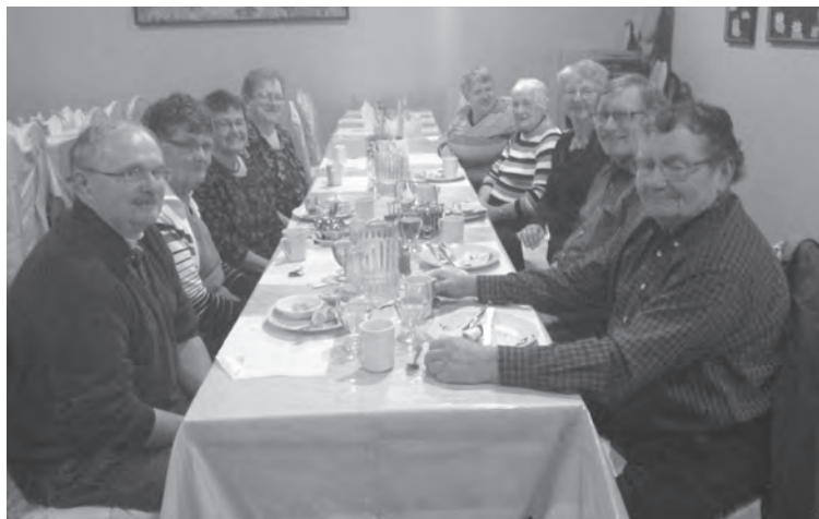
Joyce with Central Queens retirees

There seems to be increased discussion about a national drug plan as Canada is the only country that has a national health care program but no national drug coverage. Make your feelings on this issue known to your local politicians at every opportunity. Also, continue to monitor your own drug coverage to ensure that you are paying the proper amounts at your pharmacy.