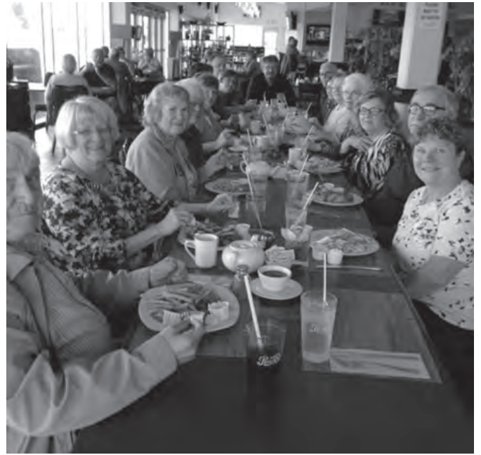
Lunch with Hernewood retired teachers, Sept. 28, 2016