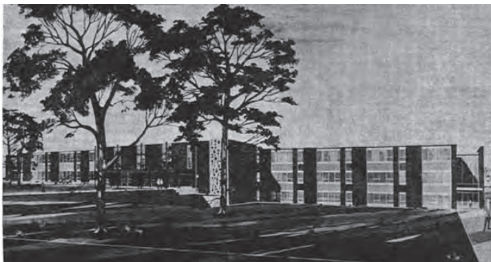
Charlottetown Rural Regional High School 1965 Department of Education Annual Report