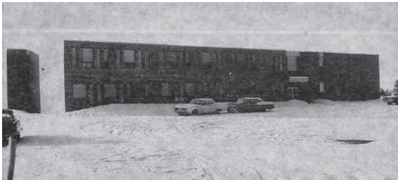
Dundas Consolidated School, officially opened December 29, 1966 1967 Department of Education Annual Report