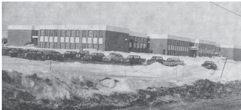
Colonel Gray Senior High School, officially opened October 14, 1967 1967 Department of Education Annual Report